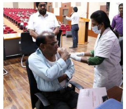
COVID 19 Booster Dose campaign at NFSC in presence of H'ble Director and college officials. Trainee officers, staff and family members were benefitted with this drive.