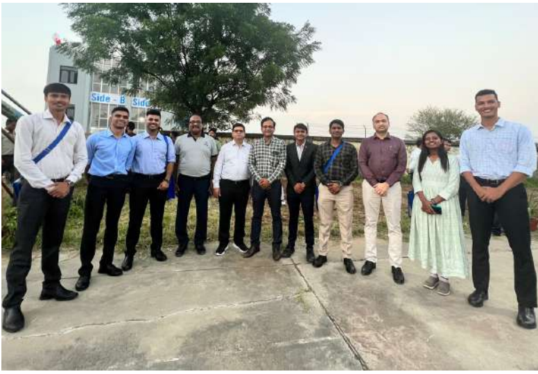
B.E. Fire Engineering Students with Alumni at IIT Gandhinagar.