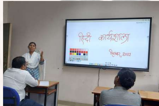
राष्ट्रीय अग्निशमन सेवा महाविद्यालय में आयोजित हिंदी कार्यशाला में भाग लेते अधिकारी एवं कर्मचारी।