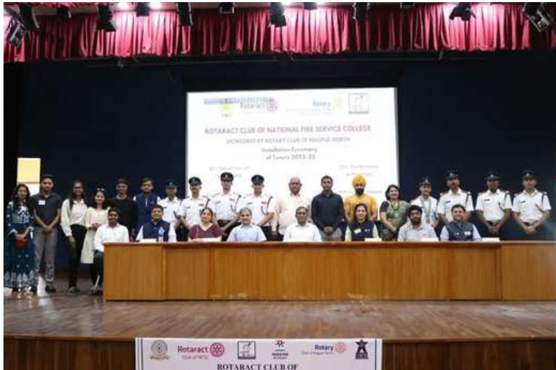
NFSC and Rotary club officials with B.E. Fire Engineering students.

The Rotaract Club of NFSC has been awarded with more than 13 awards for the Rotary Year 2021-22 by District Council 3030, Sponsor Club RCNN & South Asia MDIO. The Club has been consistently ranked in the top 10 across the district throughout the tenure of 2021-22 for its outstanding service and valuable contribution to society.