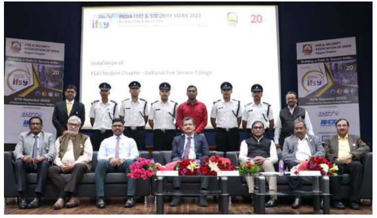
Dignitaries with new board of FSAI Student Chapter at NFSC.