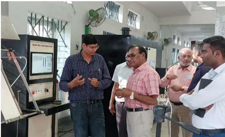
Inspection of Radiant Panel Flame Spread Tester at Fire Testing Laboratory, NFSC.

The Radiant Panel Flame Spread Apparatus measures the surface flammability by using a gas-fired radiant heat panel. It is intended to measure and describe the properties of materials, products, or assemblies in response to heat and flame under controlled laboratory conditions, and the results of this test may be used as elements of a fire risk assessment that takes into account all of the factors that are pertinent to an assessment of the fire hazard of a particular end use. The inspection of the apparatus, post its installations was done by Director and officers.