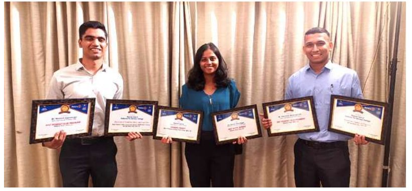
BE Students at Award Ceremony organized by RCNN.

The Rotaract Club of NFSC has been awarded with more than 13 awards for the Rotary Year 2021-22 by District Council 3030, Sponsor Club RCNN & South Asia MDIO. The Club has been consistently ranked in the top 10 across the district throughout the tenure of 2021-22 for its outstanding service and valuable contribution to society.