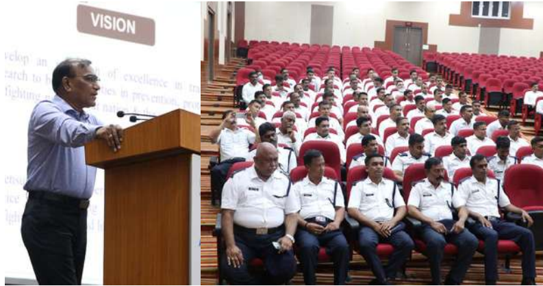
Hon'ble Director addressing the trainee officers.