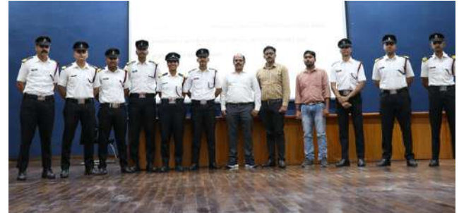
BE Fire Engineering students along with faculty members in Lead-Com Session.