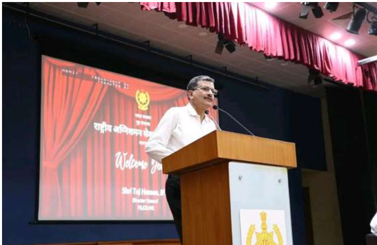
Hon'ble DG-FS, CD & HG interacting with BE students.