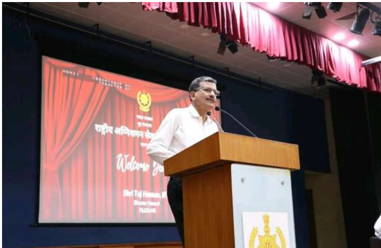
Hon'ble DG-FS.CD&HG interacting with NFSC students