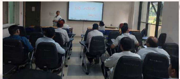
Officers and employees participating in Hindi workshop organized at National Fire Service College