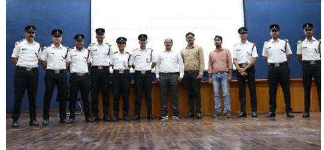
BE Fire Engineering students along with faculty members in Lead-Com Session.

Students of BE Fire Engineering participating in Lead-Com session. Lead-Com is an NFSC initiative to hone the communication and leadership skills of the students through various frameworks which will help them in their personal and professional growth.