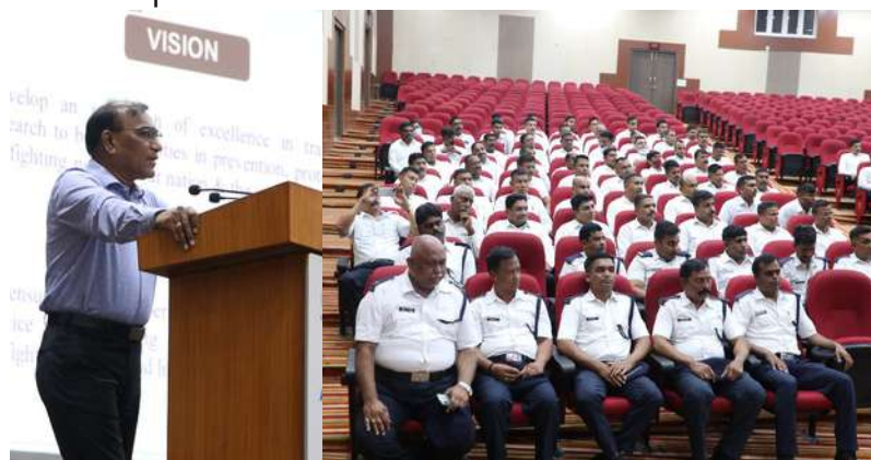
The Director addressing the Trainee officers