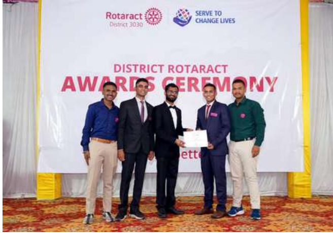
NFSC students at District Award Ceremony of Rotaract