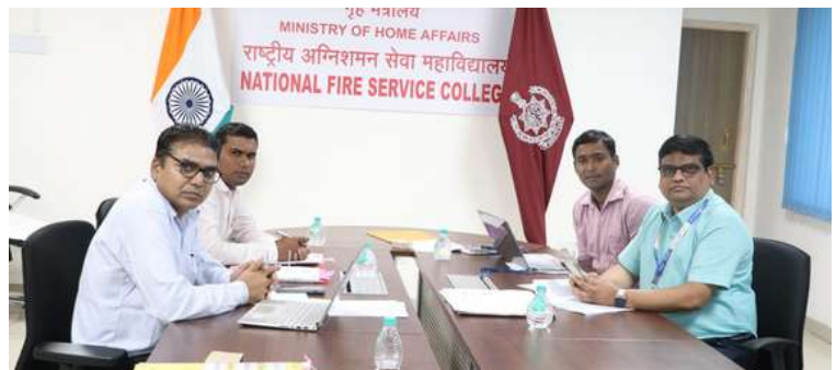
NBA Review Meeting at NFSC.