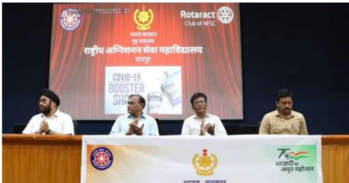
COVID 19 Booster Dose campaign at NFSC in presence of H'ble Director and college officials. Trainee officers, staff and family members were benefitted with this drive.