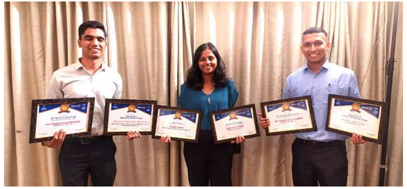
NFSC Students at Award Ceremony organized by RCNN

The Rotaract Club of NFSC has been awarded with more than 13 awards for the Rotary Year 2021-22 by District Council 3030, Sponsor Club RCNN & South Asia MDIO. The Club has been consistently ranked in the top 10 across the district throughout the tenure of 2021-22 for its outstanding service and valuable contribution to society.