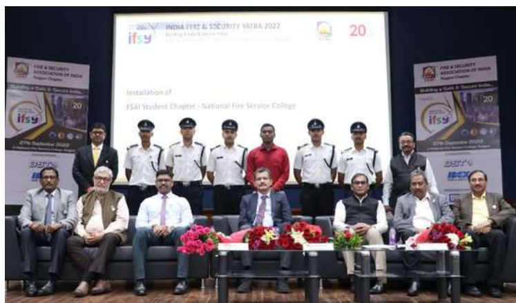
Dignitaries with new board of FSAI Student Chapter at NFSC

Hon'ble DG FS,CD &HG attended the function as Chief Guest and in his address congratulated the team for this development.